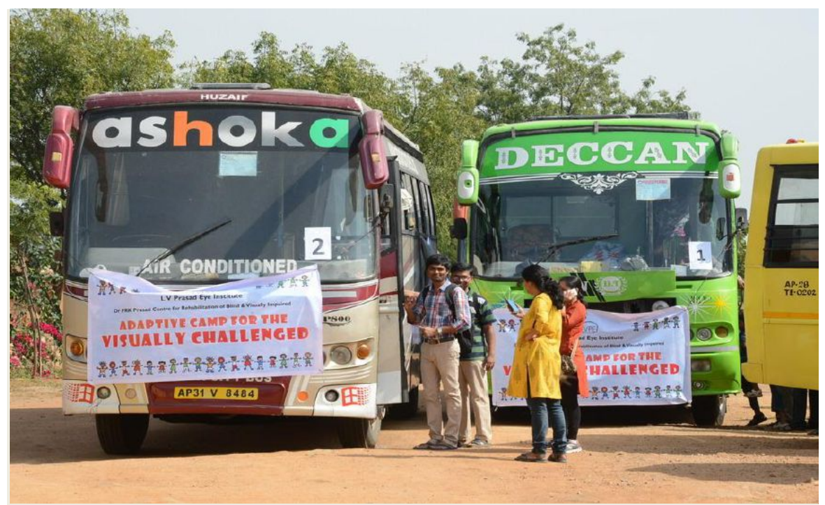
Getting ready to start