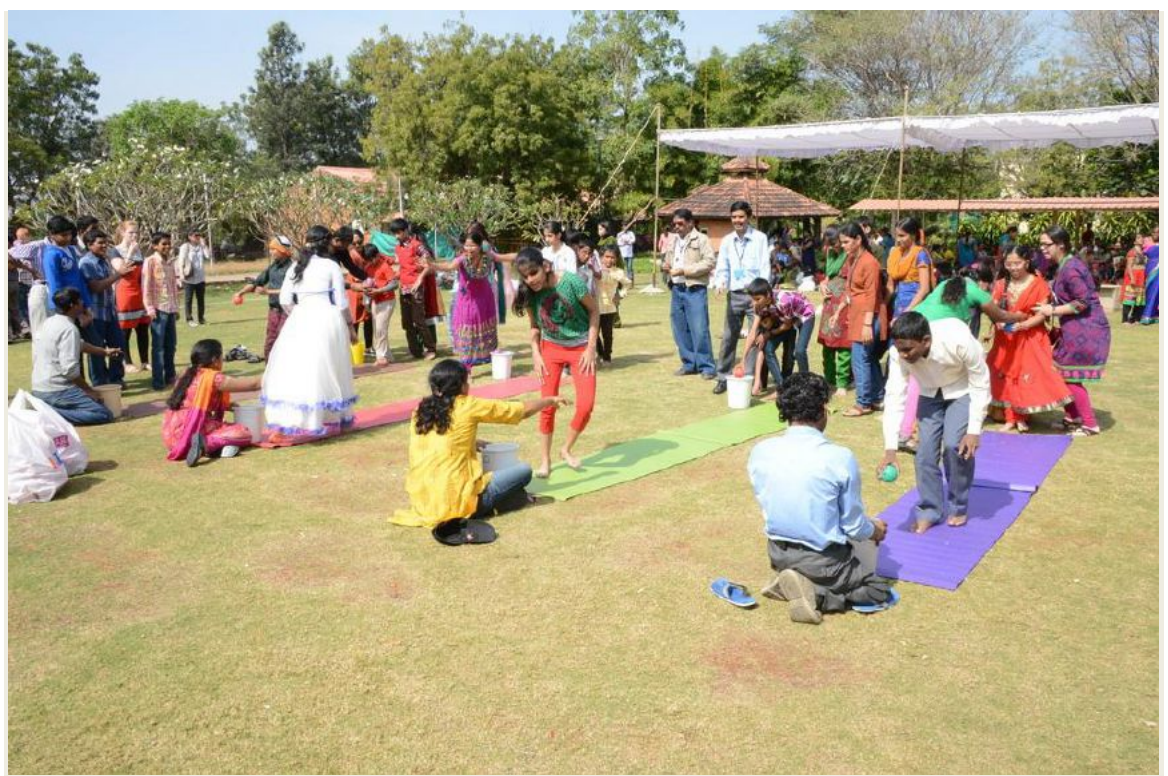
Transferring balls - Middle group