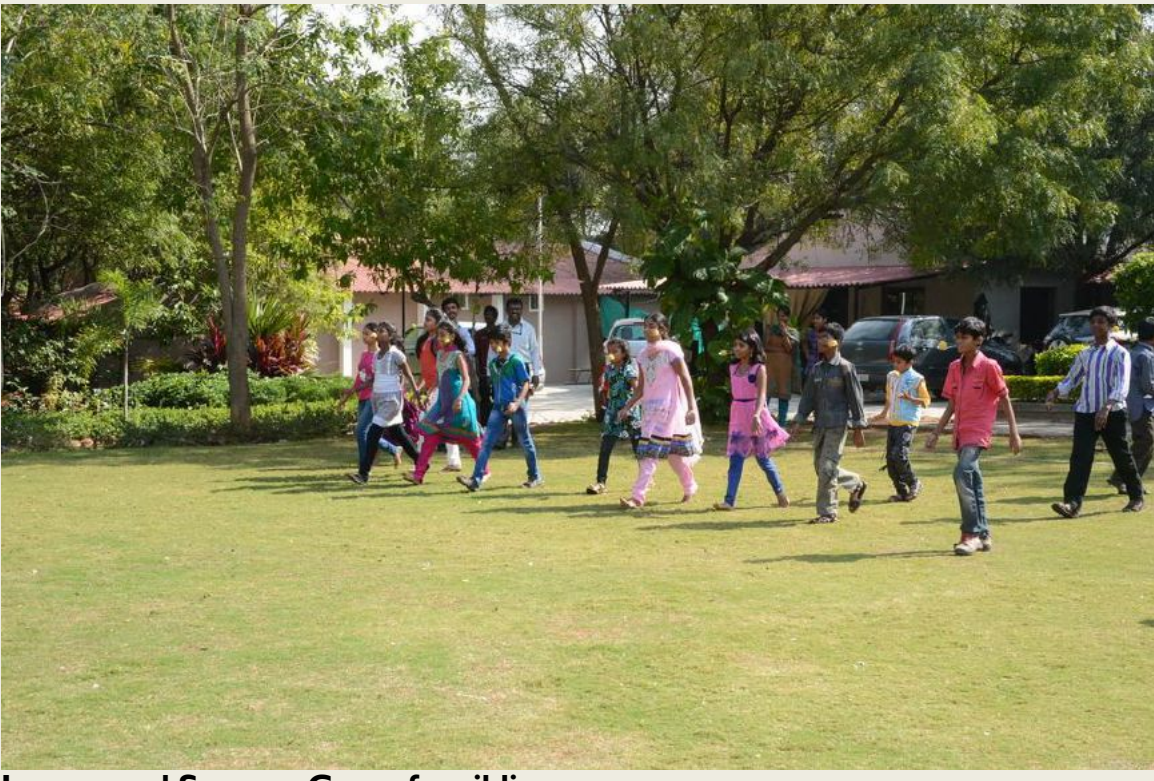
Lemon and Spoon – Game for siblings