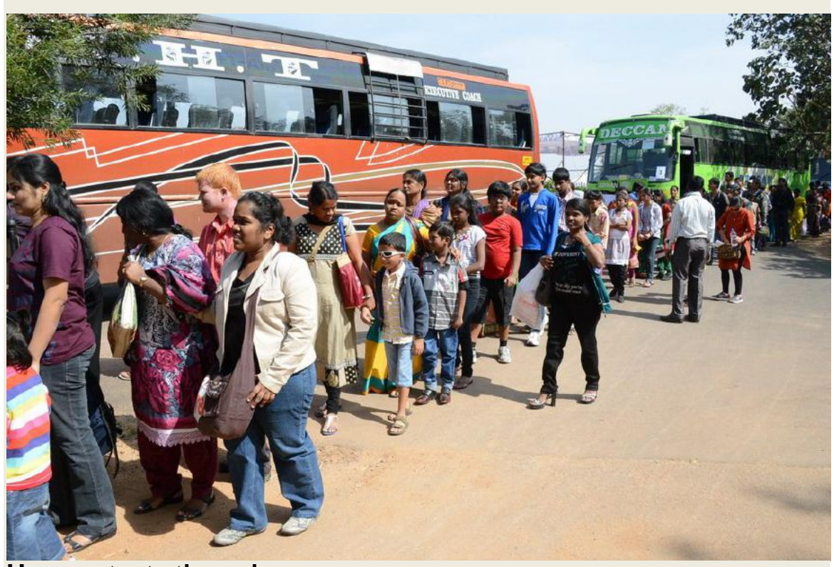
Happy entry to the park