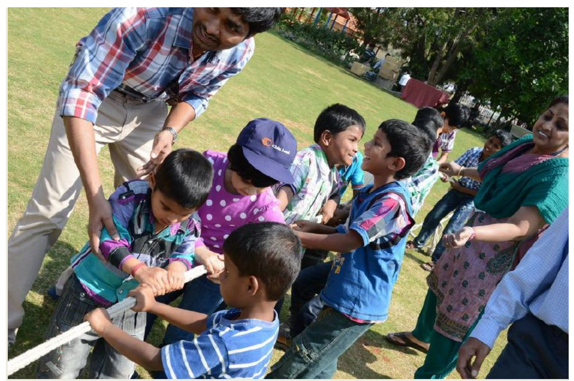
Tug off war - Toddlers