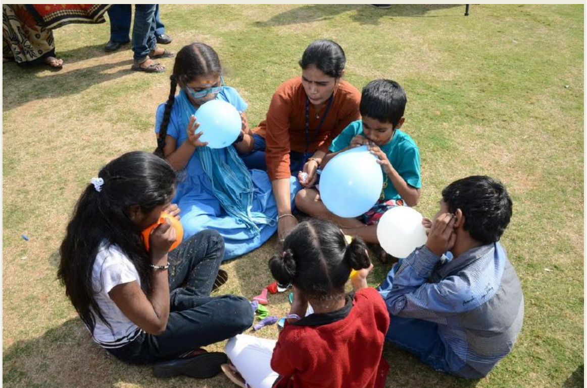
Balloon blowing and bursting - Middle group