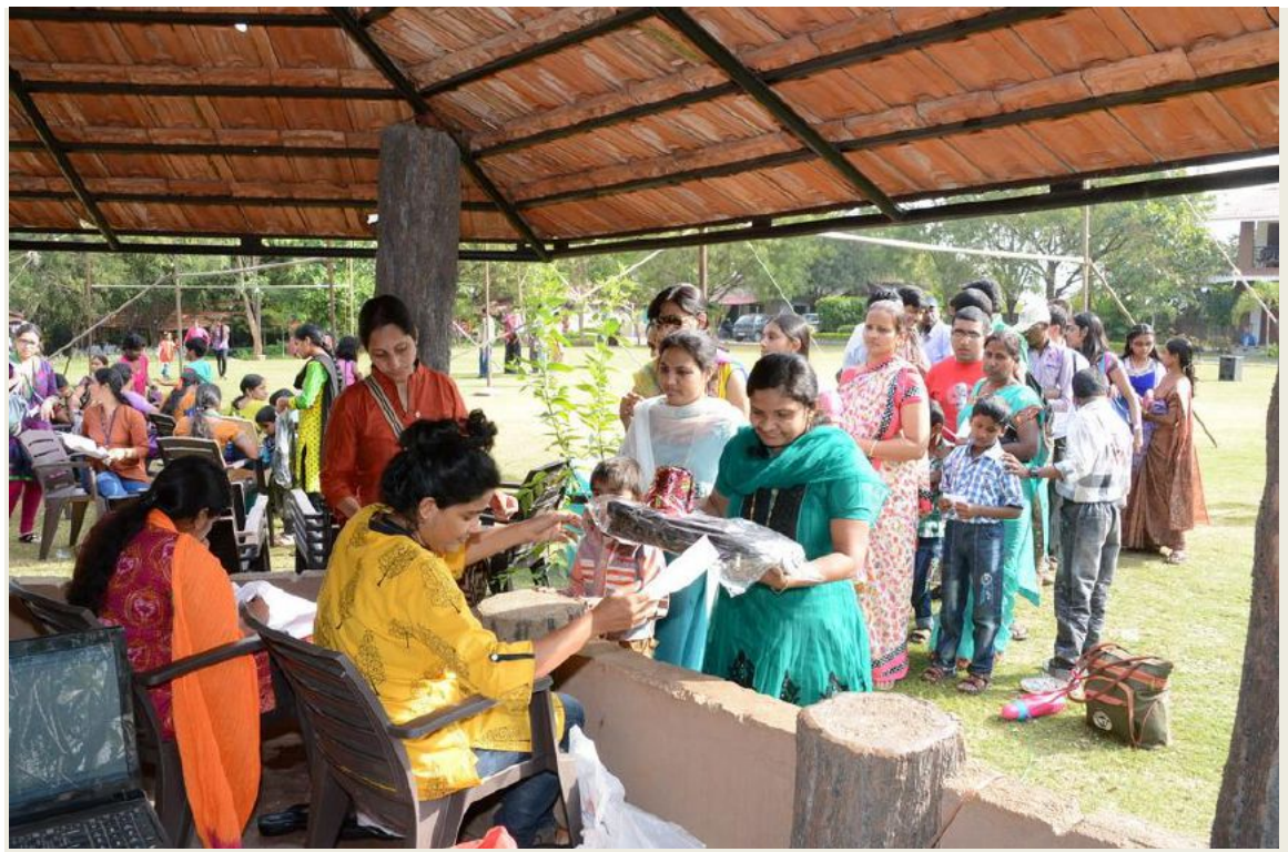
Distributing school bags - Common gift to participants