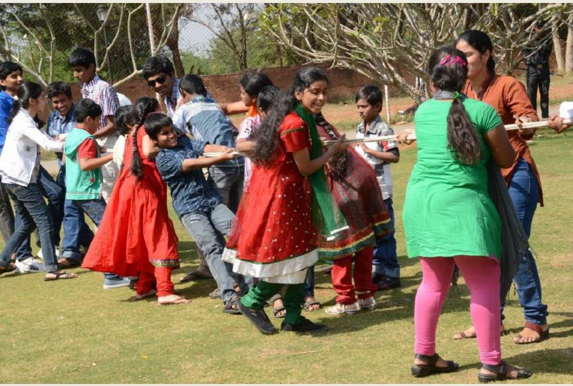
Tug off war - junior group