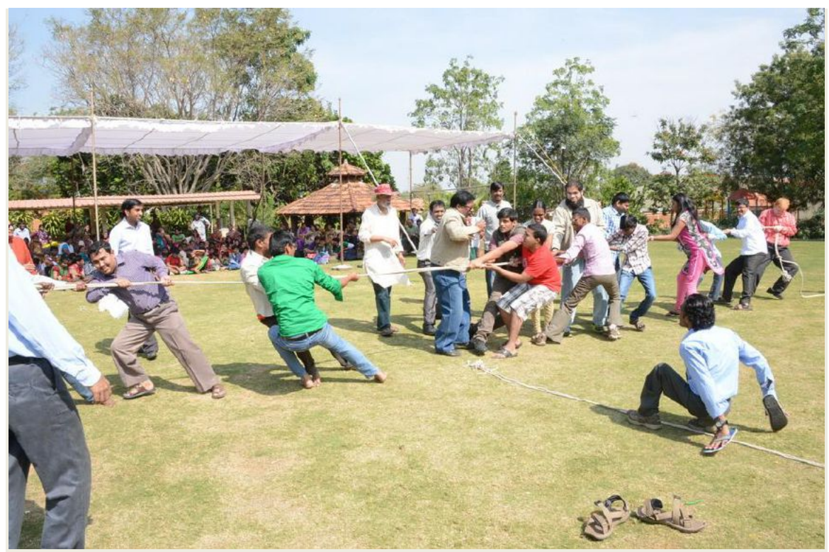
Tug off war - Senior group