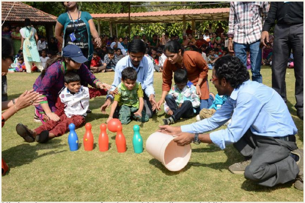
Hitting the target, game for the multi-handicapped children