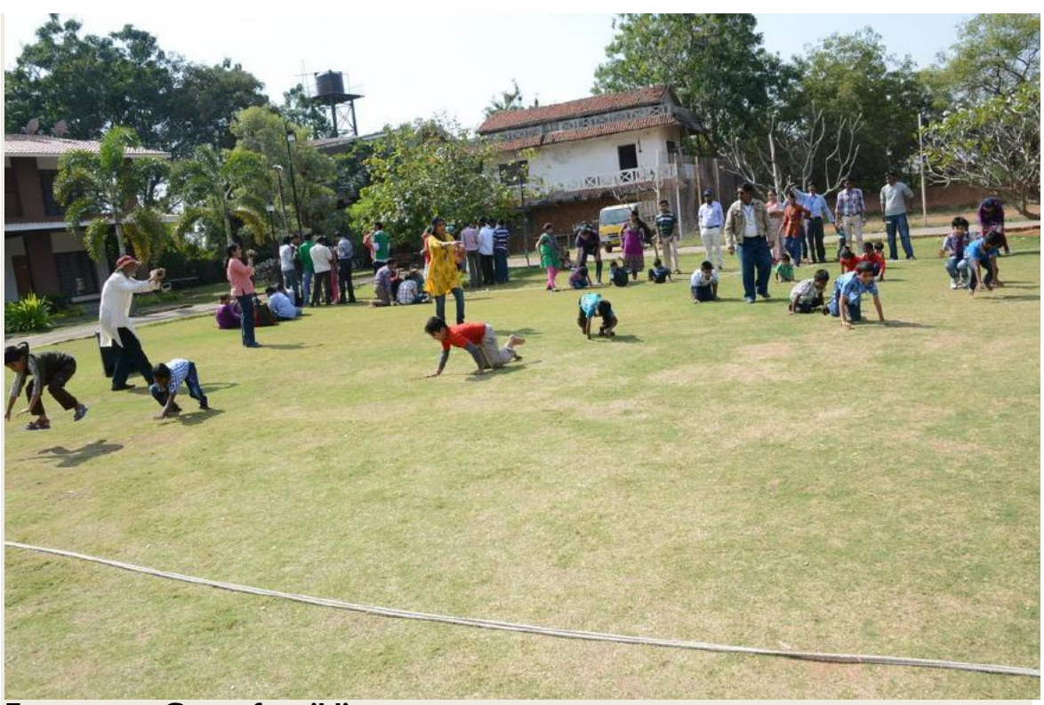
Frog race - Game for siblings